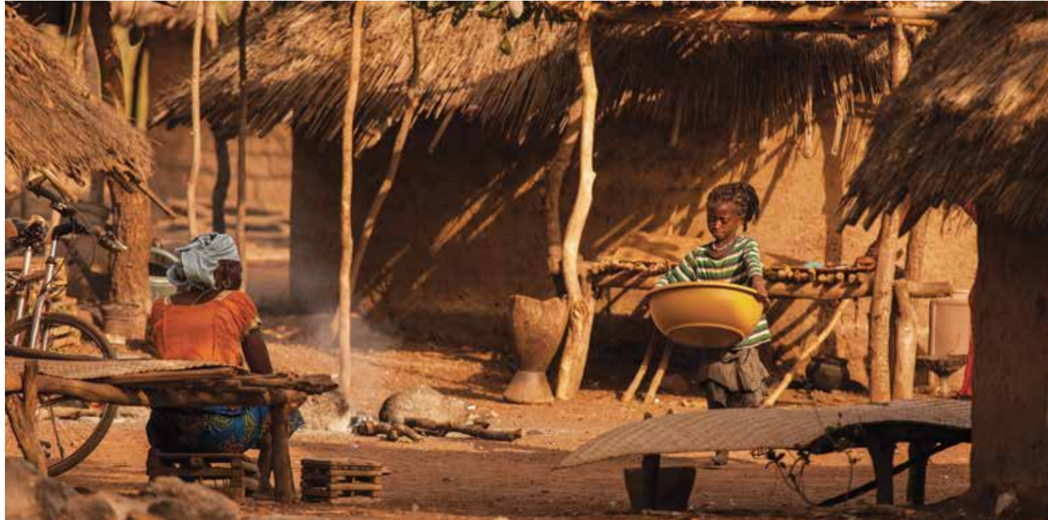
HE is the one who is going to build His Church, and HE rules over the nations.

person respectable? What is important [to the people]? How does an important message get communicated?