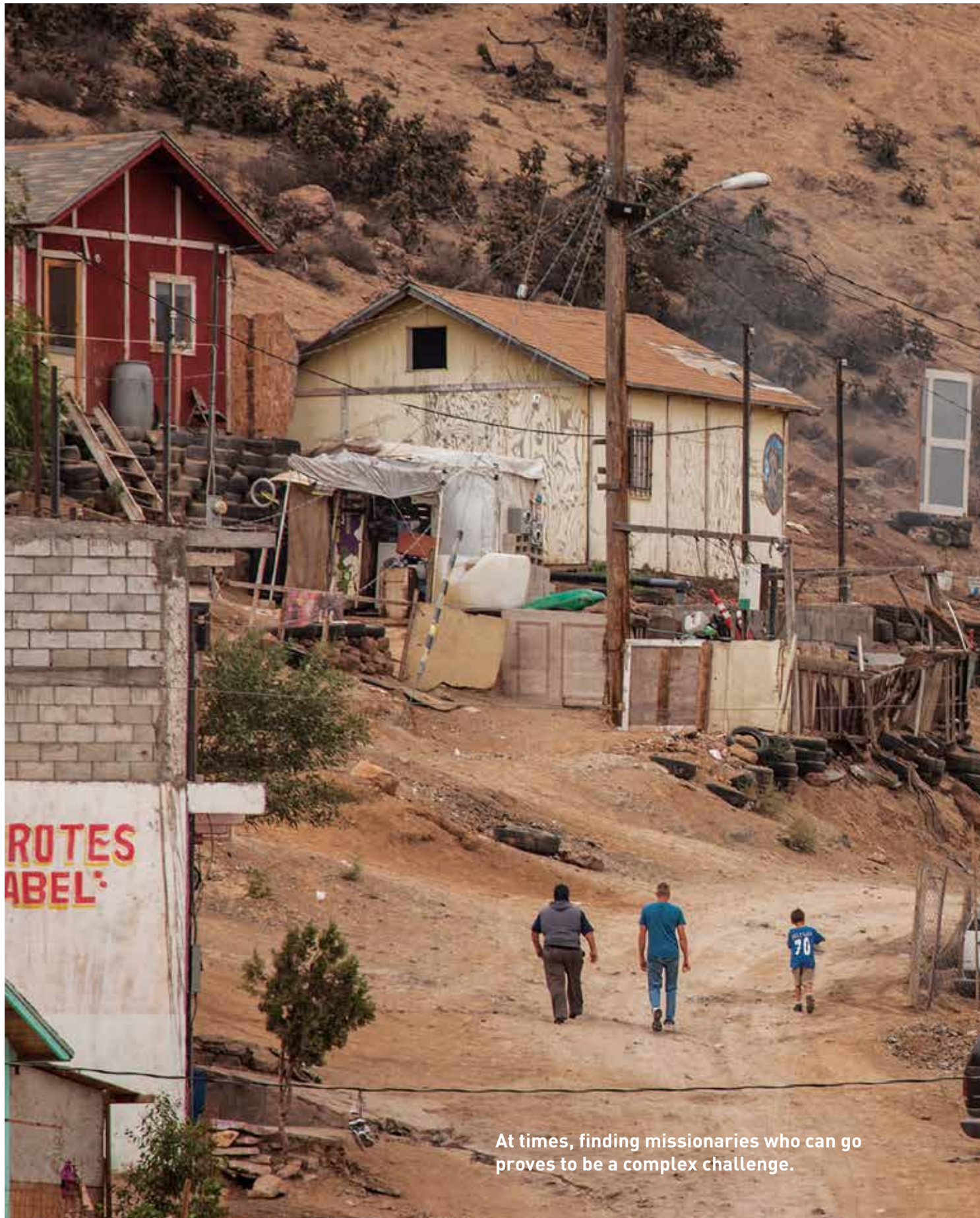
At times, finding missionaries who can go proves to be a complex challenge.

consultants, leaders, church planters and support missionaries in this new country.